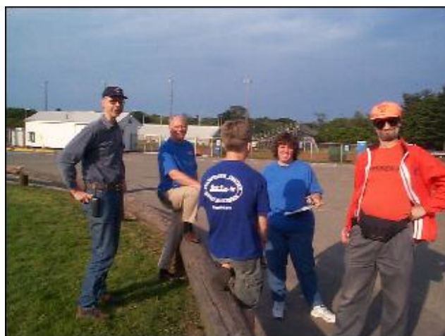
The FARA volunteers before the Framingham 300th Road Race.