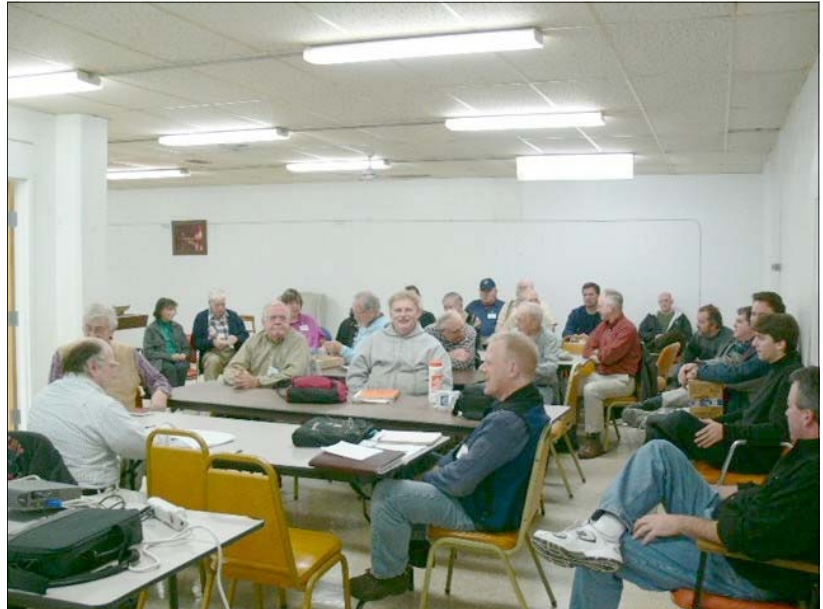
Huge crowd for the November meeting.