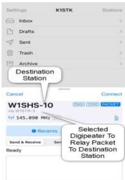
Figure 8 above: RadioMail screen shot showing selected path.

I use the RadioMail app for iOS to compose e-mails, selecting the TNC hardware that will interact with my radio, and selecting destination Radio Mail Stations as well as any digipeaters that may be required to relay the packet to its destination.