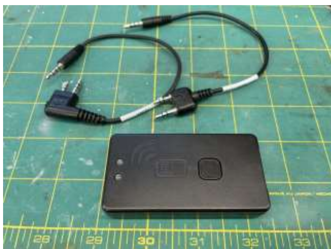
Figure 6 above: Mobilinkd TNC4 on bottom, Yaesu HT interface cable top left, Icom HT interface cable top right.

The Mobilinkd TNC4 is described as a "Bluetooth APRS TNC" however its uses extend beyond APRS (Automatic Packet Reporting System). One common application is sending and receiving Winlink e-mail via VHF or UHF. The device can be paired with your iOS or Android device or your computer via Bluetooth adding a KISS TNC to most radios with the proper interconnect between the Mobilinkd TNC4 and your transceiver. Adapter cables for common HTs are available from Mobilinkd, but making your own cables is straightforward.