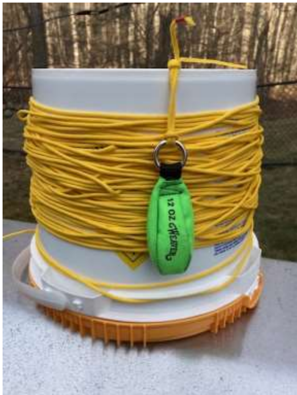
Figure 5 above: Weaver 12 oz. arborists throw weight and line kit $28.99 (KB1VXY)