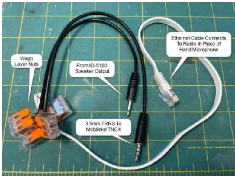
Figure 7 above: Prototype cable assembly to interface the Mobilinkd TNC4 to the Icom ID-5100

I cut an Ethernet cable in half and stripped the necessary leads, while the 3.5mm connectors were spares I had in the junk pile. I prefer to use Wago lever nuts when prototyping cable harnesses as they are fast to work with and allow for quick reconfiguration when mistakes are made in the wiring diagram. Only once the harness has been tested and functions properly do I solder, insulate, and strain relieve all electrical connections. Don't forget to label the harness with its intended purpose since many cable assemblies may look similar but have different wiring layouts.