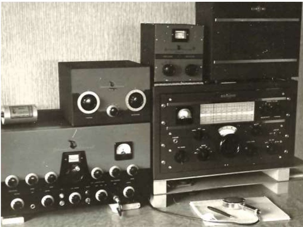
Figure 3. A WIDL vintage station, showing a Collins 75A1 receiver, an E.F. Johnson Viking II transmitter and E.F. Johnson balanced antenna tuner.