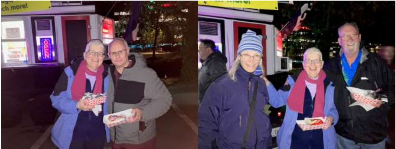
Above: Figures 6 (left) and 7 (right).