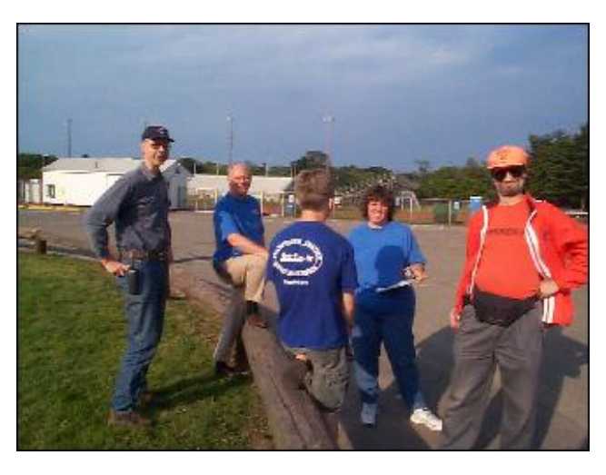
The FARA volunteers before the Framingham 300th Road Race.

If you would like to change the address on your Circuit label, please email <a href="mailto:fara.org">fara.org</a>. Or, you can call the Club at 508-879-8097