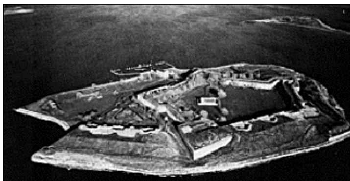
Aerial view of George's Island

Seven miles from downtown Boston, George's Island contains a large dock, picnic grounds, open fields, paved walkways, a parade ground and a gravel beach. Guided tours of historic Fort Warren and a slide show are offered. George's also has the only food-service--a snack bar--on the islands.