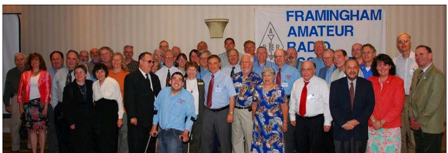
Many past and present FARA members turned out for the 75th Anniversary Party in June.